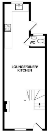
GROUND FLOOR APPROX. FLOOR AREA 329 SQ.FT. (30.6 SQ.M.)